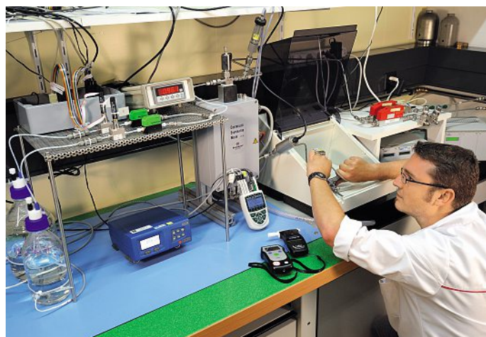
The generator for wet breath-alcohol analysis built at METAS.

The SI-traceability of the breath-alcohol tests results is desirably ensured without the OIML-convention. [1,3,4]