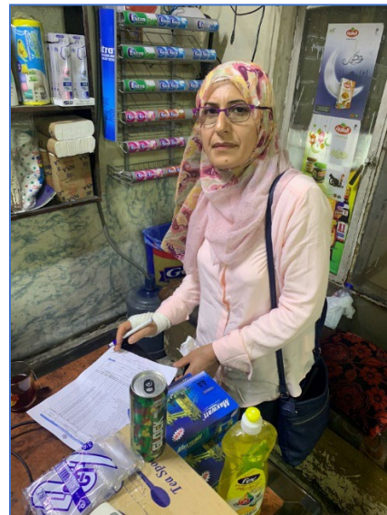
Mrs. M. set up a small grocery shop in Baghdad and hoped to improve her skills on the labor market by taking language courses.